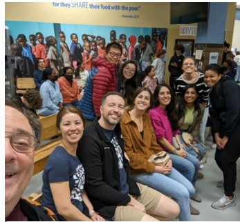
Residents and Faculty participate in a Feed My Starving Children program Dec 1, 2023

A second event is being planned by the residents and DHMG-IM Chandler staff. If anyone is interested in learning more about FMSC they can go to the website https://www.fmsc.org/