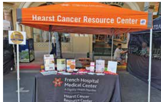
Downtown SLO Farmers Market